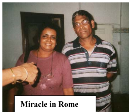
Miracle in Rome

ministry, ably assisted me. The flat I shared with