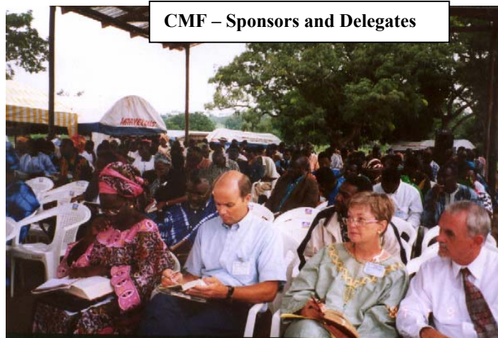
CMF – Sponsors and Delegates