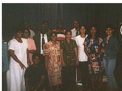
Sri Lankan Church in Rome