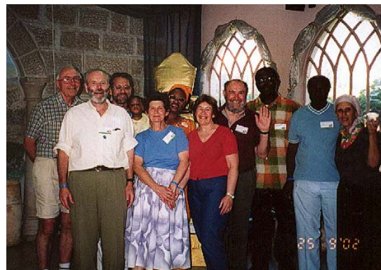
Mount Zion Prayer Fellowship