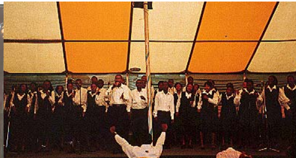
Choir of The Carpenter's Church, Port Harcourt