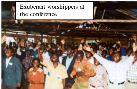
Exuberant worshippers at the conference

This year's trip to Uganda was more hectic than last year's visit. It also lasted longer as we set out early on the 1 st of March and returned early on Good Friday (29 th of March). My companions of last year