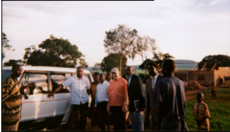
Our host chatting with some guest pastors

Because of the adjustments to our lifestyle occasioned by our bundle of joy, there has only been one international trip this year. However, there has been no shortage of visits by individuals and groups of people in need of ministry, as well as church 'away-weekends' and invitations to preach in the UK. The fellowship that meets in our house also continues to flourish. There has also been a great deal of variety in the types of help required. As people who have recently met Jesus have been counselled and encouraged to continue in the Way, so are settled Christians who are not growing helped to receive the power we all need from the Holy Spirit. Some mighty situations of wonderful deliverance from the clutches of the Evil One and healing, all in the name of Jesus, have also been our experience. The Board of Trustees which oversees the activities of the Healing Love of Christ