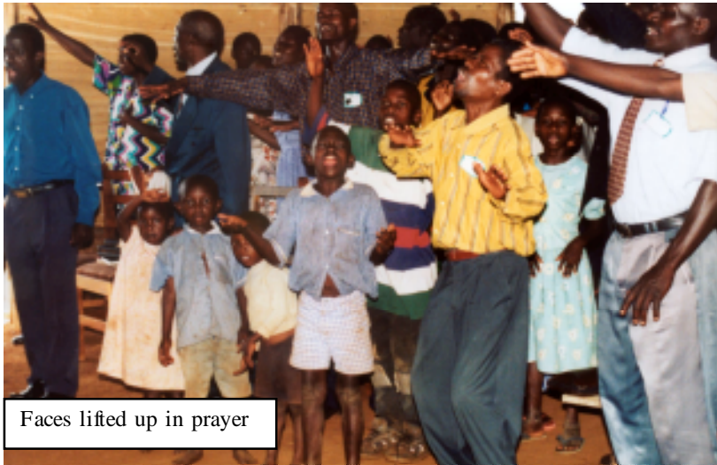
Faces lifted up in prayer

gratifying to see her alive and well this year