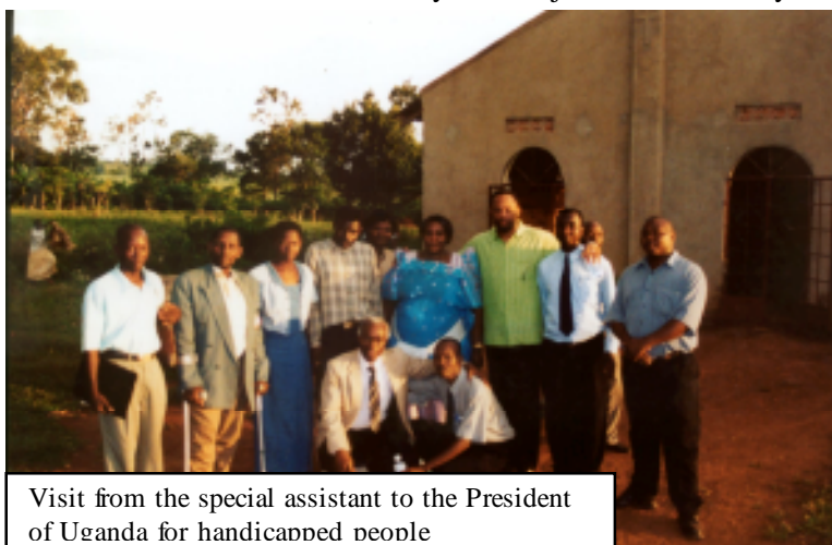
Visit from the special assistant to the President of Uganda for handicapped people